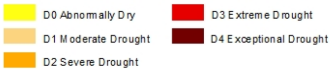
Precipitation (in) 3/21/2016 - 3/27/2016