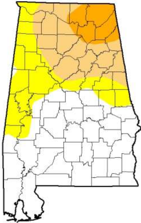
Drought Conditions (Percent Area)

May 31, 2016 (Released Thursday, Jun. 2, 2016) Valid 8 a.m. EDT